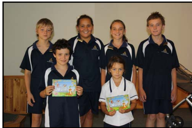
School Captains' Awards