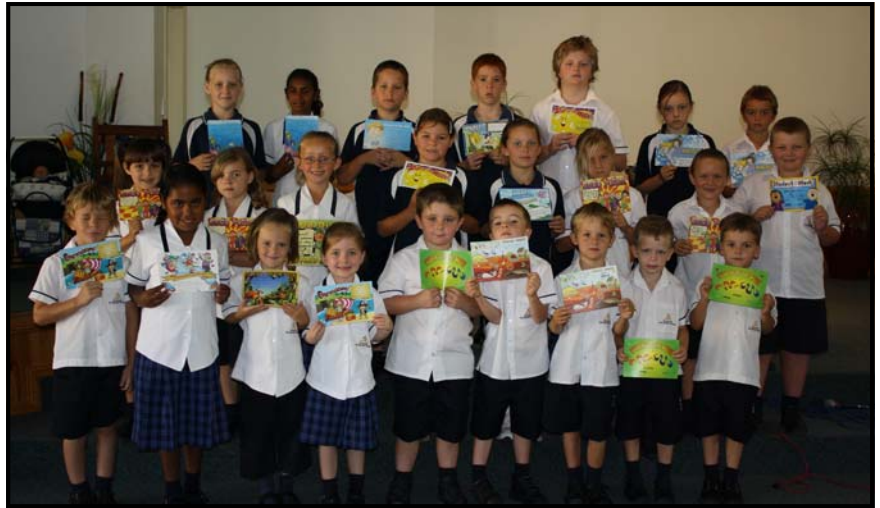
Primary Students of the Week