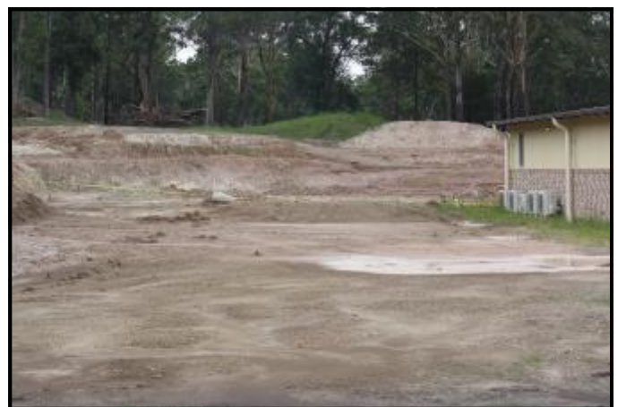
The area directly behind the school office showing the site at the rear where the new classroom block will go, along with carpark area.